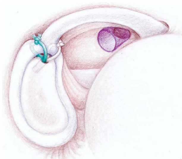
FIGURE 3. The completed V-type SLAP II repair.

nula is temporarily removed over the switching stick and then screwed in again, leaving the sutures outside the cannula. This step is important to avoid the cumbersome suture tangling.